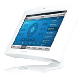
9" Tilt Touch Screen