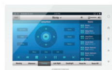
7" Surface Mount HD Touch Screen