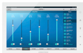
10.1" Surface Mount HD Touch Screen