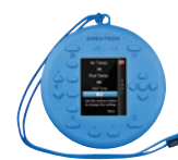
Waterproof Wireless LCD Remote