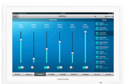
V-Panel™ 24" HD Touch Screen