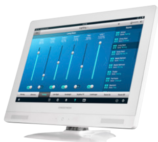
V-Panel™ 15" HD Tilt Touch Screen