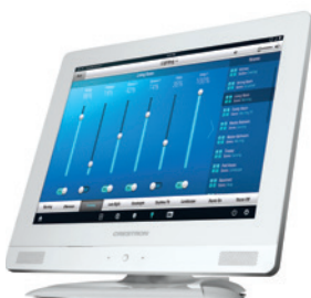
V-Panel™ 12" HD Tilt Touch Screen