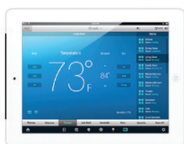
Crestron Mobile Pro® Control App for iPhone®, iPad® and Android™ Devices