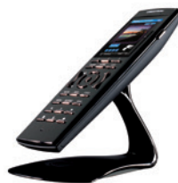
Handheld Wireless 2.8" Touch Screen